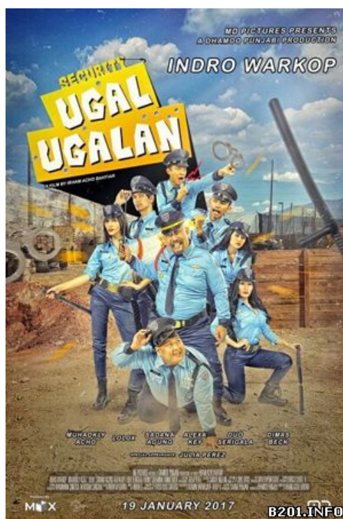
Figure 1 Security Ugal-Ugalan Film Cover