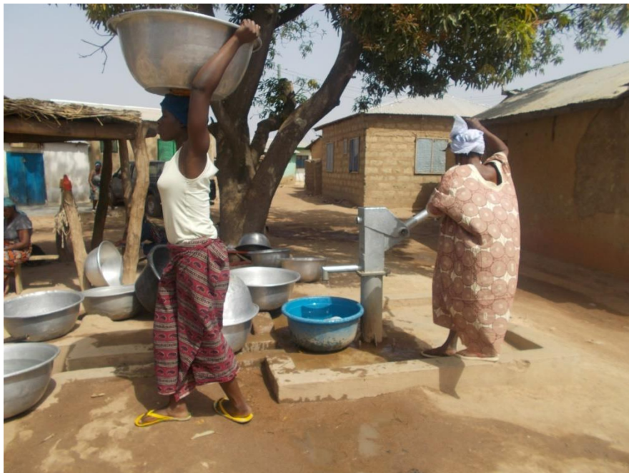
Plate 1: Borehole in the Wa Community (WCMA)

The government and some NGOs constructed boreholes and wells as an intervention to reduce the spread of water-borne diseases. Therefore, most of the inhabitants depend heavily on groundwater sources. These groundwater sources are harnessed through hand-dug wells and boreholes. Groundwater resources seemed to be the most feasible and available water resource for many communities within the Wa Municipality. Much of the agricultural activities are rain-fed hence there are limited irrigation activities in the Wa Central Municipality.